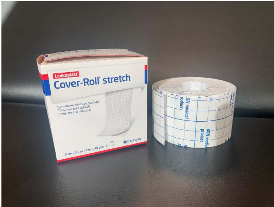
Cover-Roll® (2 inches wide)