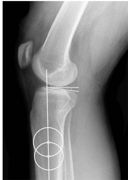
Figure 4. Radiographic diagram showing the method used in determining tibial slope, which was the angle between the tibial plateau and the line perpendicular to the middiaphysis of the tibia on the lateral knee radiograph.

been reported to be 0.96 \pm 0.134 in men and 0.99 \pm 0.129 in women. 8 Patella baja has been reported to be present when the Caton-Deschamps index was below 0.6. 8 The method described by Miura et al 31 was a modification of the Blackburne-Peel method. However, it differs because the distal end of the femur is used as the reference point instead of the tibial plateau. A line perpendicular to the tibial diaphyseal line was drawn at the distal end of the femur (Figure 3). The distance from the femoral condyle line to the inferior-most aspect of the articular surface of the patella was then measured, and the ratio of that distance to the length of the articular surface of the patella was then calculated to arrive at the Miura-Kawamura index (Figure 3). Using the Miura-Kawamura index, a change of 10% in patellar height from preoperative to the 2-week postoperative assessment has been reported to be significant. 31