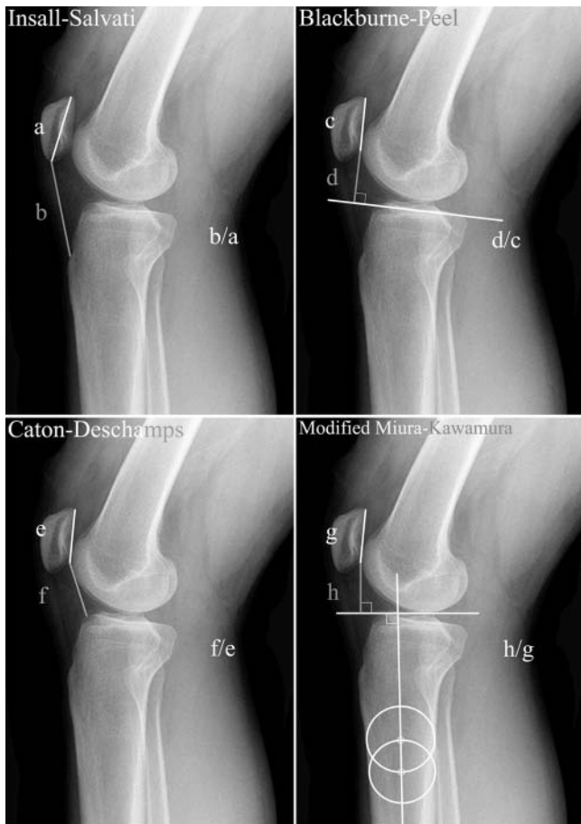
Figure 3. Radiographic diagrams showing the 4 measurement ratios used to assess patellar height. Insall-Salvati: a, diagonal length of the patella; b, length of the patellar tendon. Blackburne-Peel: c, length of the patellar articular surface; d, distance from the inferior tip of the distal patellar articular surface to a line tangent to the proximal tibial articular surface. Caton-Deschamps: e, length of the patellar articular surface; f, distance from the inferior tip of the articular surface of the patella to the anterosuperior angle of the tibia. Miura-Kawamura: g, length of the patellar articular surface; h, distance from the femoral condyle line to the inferior-most aspect of the patellar articular surface.

been reported to be 0.96 \pm 0.134 in men and 0.99 \pm 0.129 in women. 8 Patella baja has been reported to be present when the Caton-Deschamps index was below 0.6. 8 The method described by Miura et al 31 was a modification of the Blackburne-Peel method. However, it differs because the distal end of the femur is used as the reference point instead of the tibial plateau. A line perpendicular to the tibial diaphyseal line was drawn at the distal end of the femur (Figure 3). The distance from the femoral condyle line to the inferior-most aspect of the articular surface of the patella was then measured, and the ratio of that distance to the length of the articular surface of the patella was then calculated to arrive at the Miura-Kawamura index (Figure 3). Using the Miura-Kawamura index, a change of 10% in patellar height from preoperative to the 2-week postoperative assessment has been reported to be significant. 31