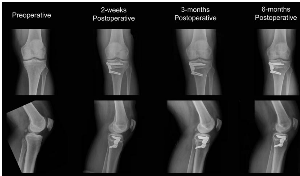
Figure 2. Illustrative radiographs demonstrating the specified time frames when patellar height was measured.

extending approximately 6 to 8 cm. A subperiosteal dissection was performed under the patellar tendon and the deep infrapatellar bursa anteriorly and under the superficial medial collateral ligament and the popliteus musculature posteromedially. Two guide pins were placed parallel to the joint line under fluoroscopic guidance in the coronal plane and adjusted as necessary in the sagittal plane to follow the native sagittal plane slope of the tibia. The osteotomy was performed to within 1 cm of the lateral cortex. A spreader device was used to slowly open the osteotomy to the desired amount of opening. The osteotomy plate was then placed and secured with the fixation with the 4 screws. Bone graft was then inserted under fluoroscopic guidance. For prophylaxis against deep venous thrombosis, 325 mg daily of enteric coated aspirin was prescribed for 8 weeks postoperatively.