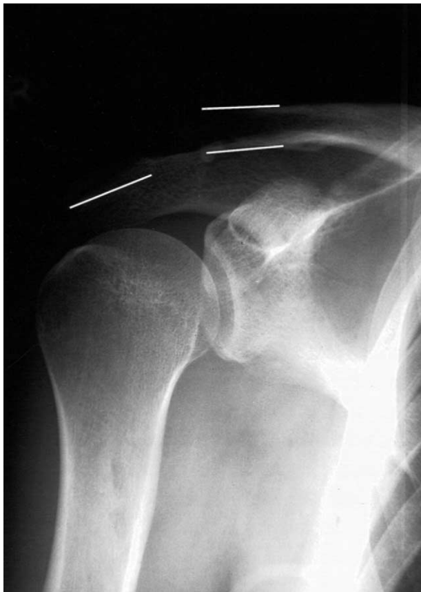
FIGURE 3. Anteroposterior radiographic view, right shoulder, shows the appearance after reconstruction of the coracoclavicular ligament with a semitendinosus graft for a failed right modified Weaver-Dunn reconstruction (white lines drawn to supplement visualization under acromion and superior/inferior surfaces of distal clavicle).

ness, 9 reconstruction of the coracoclavicular ligament with a semitendinosus graft through bony tunnels attempts to reconstruct the normal anatomy of the coracoclavicular ligament and there is no need for removing hardware with a second operation or concerns for hardware migration. 10 If patients agree to an autologous tendon harvest, one can even eliminate the small risk of a graft rejection.