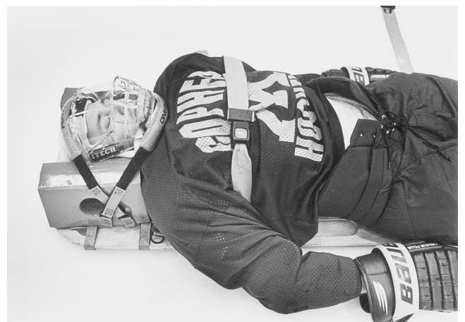
Figure 2. Recommended method of immobilization of an ice hockey player with a potential cervical spine injury. The helmet is left in place, lateral foam pads secure the helmet in position, and straps secure the athlete to the backboard.

Exceptions to our recommendation of not removing the helmet in a ice hockey player with a possible cervical spine injury are limited. The first exception would be when prehospital personnel are unable to remove the face mask