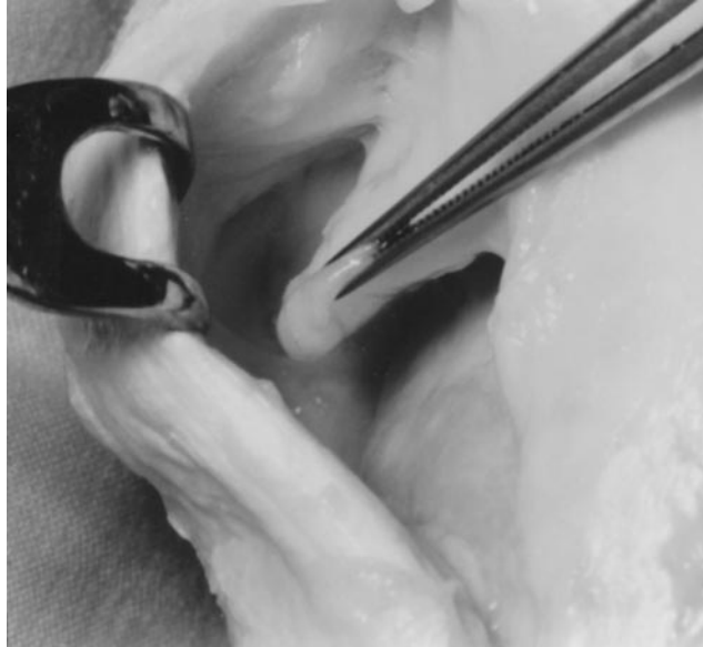
Figure 2. Fat pad extension ("apron") extending from the retropatellar fat pad and partially dividing the deep infrapatellar bursa into an anterior and posterior compartment (right knee, medial view, patellar tendon retracted, fat pad "apron" in tissue forceps).

absence of this bursa and whether it communicates with the knee joint have not been documented.